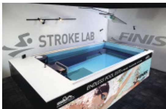
FINIS Testing and Training Lab