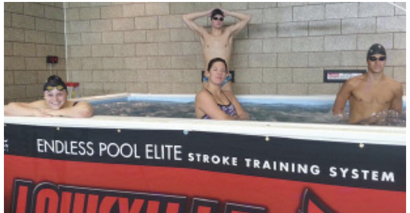
University of Louisville