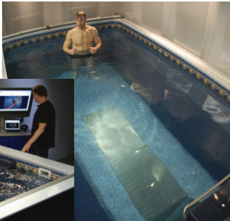
Front Mirror and Floor Mirror