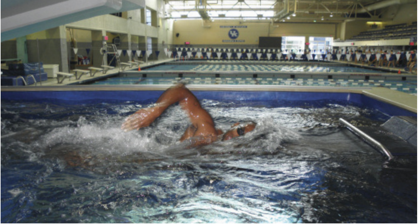
0:51 hundred-yard pace