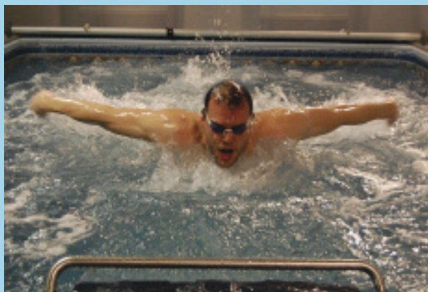
Eight-foot width to accommodate even the tallest swimmers.