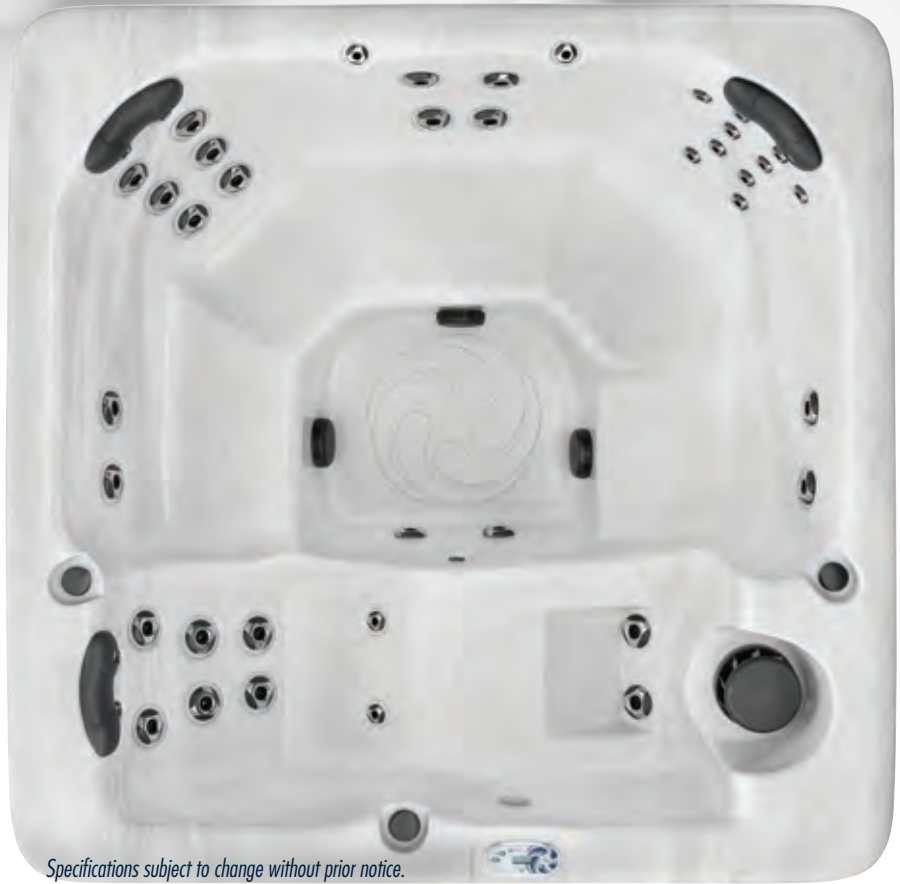
Specifications subject to change without prior notice.